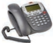
5410 Digital Telephone

The Avaya 5402 single-line digital phone offers a high-end feature set, including a productivity local call log and speed dial directory. With an advanced user interface, the 5402 digital phone's 2 line, 24 character display eliminates the need for paper labels. 14 programmable feature keys and 10 fixed feature buttons ensure easy access to this phone's advanced functions.