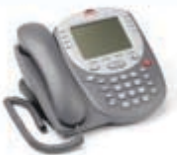
5420 Digital Telephone

This single line telephone features a 5 line, 29 character display, 12 programmable buttons, 14 fixed feature keys and 4 soft keys, a full-duplex speaker phone and other usability features. The Avaya 5410 digital phone connects to the IP Office server through an IP office digital station port.