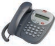
5402 Digital Telephone